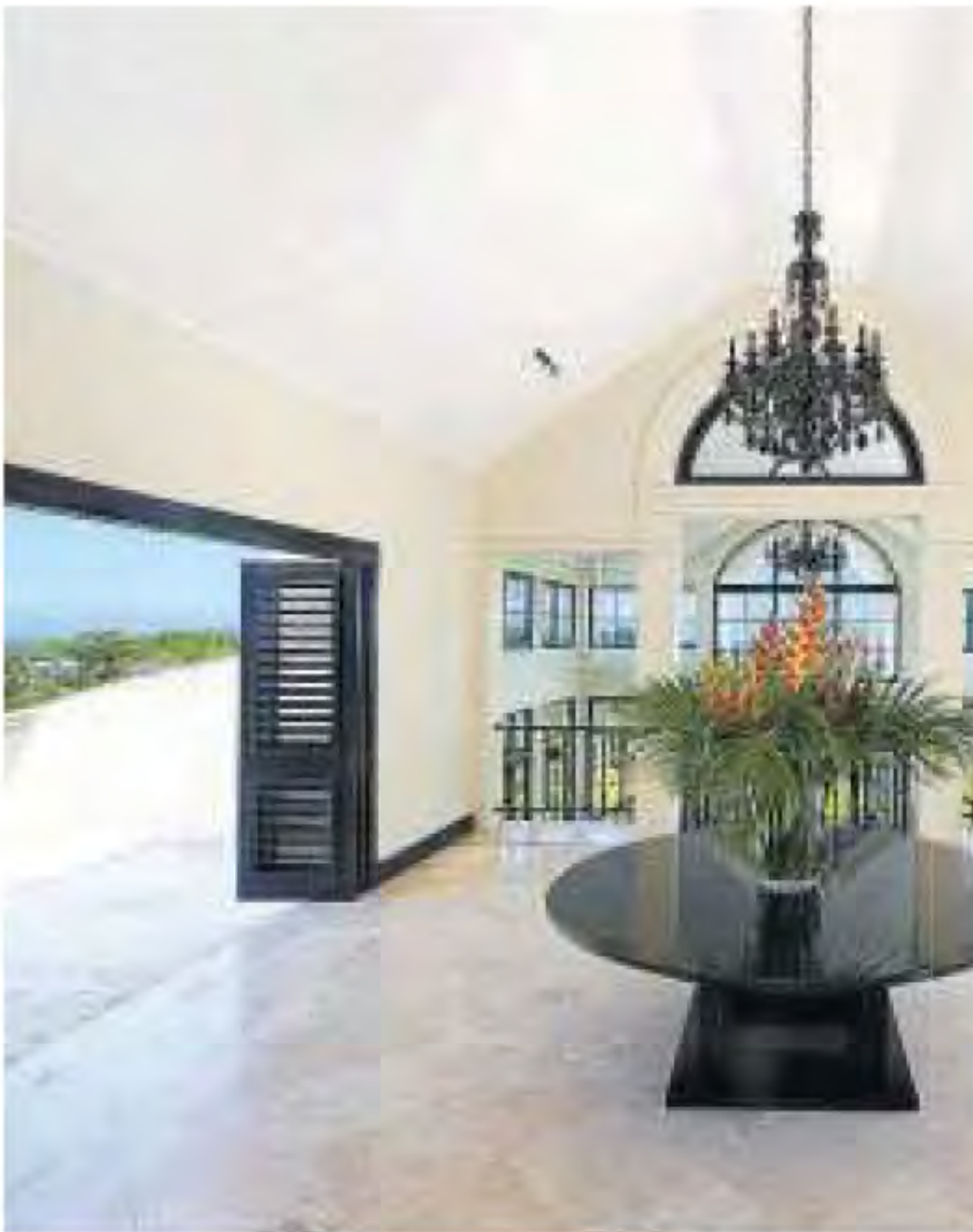
Hanover Grange's grand entrance

Both are very excited by the prospect and are looking forward to producing work in Jamaica and getting to know the country and local art community. See more on these artists on Pages 4 & 5.