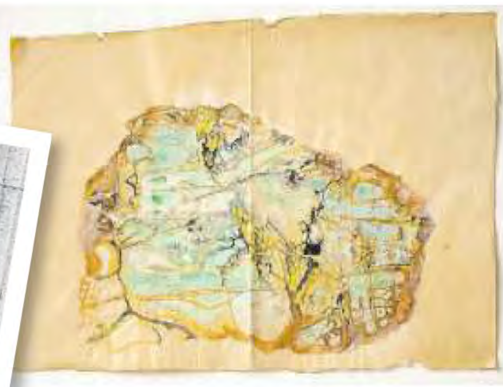
Variscite by Lindsay Sekulowicz