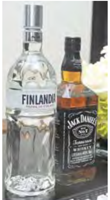
Finlandia vodka and Jack Daniel's Tennessee Whiskey were the featured spirits at the Caribbean Producers Jamaica watering holes.