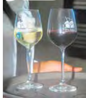
Branded stems of vino were highlights of the Caribbean Producers Jamaica bar service.