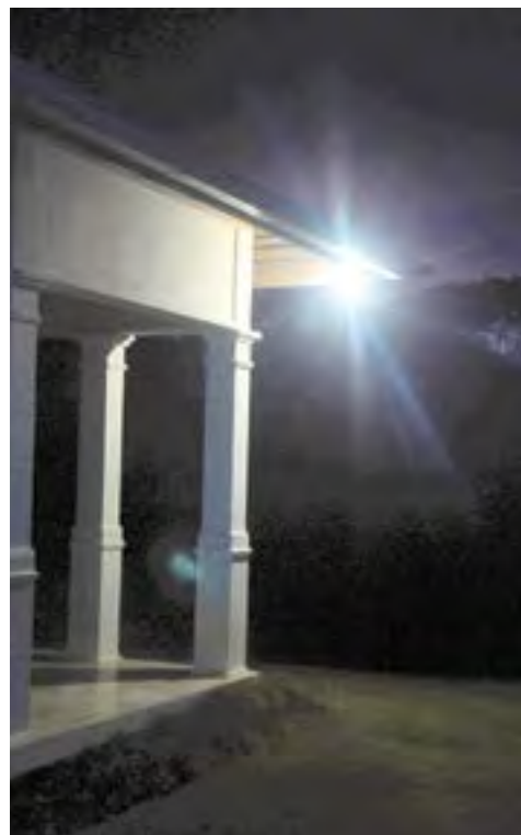
A minimal outdoor lighting plan ensured that atmosphere was maintained.