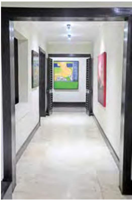
The art-filled walls of The Tryall Club villa